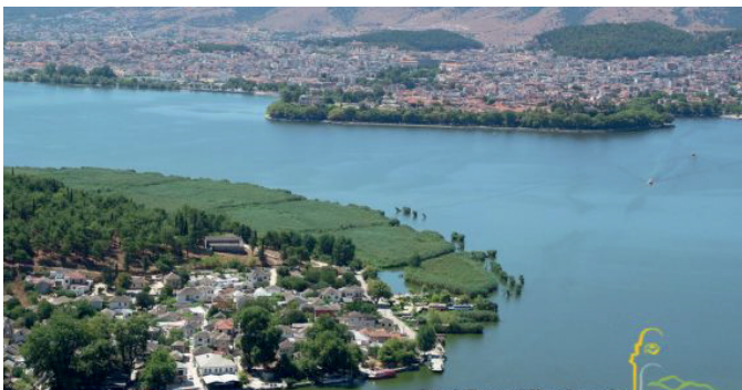
City of Ioannina : Panoramic View

The 6th Panhellenic Conference on Metallic Materials , will be held in Ioannina Greece on 7-9 December 2016. The Conference is Co-organized by the Laboratory of