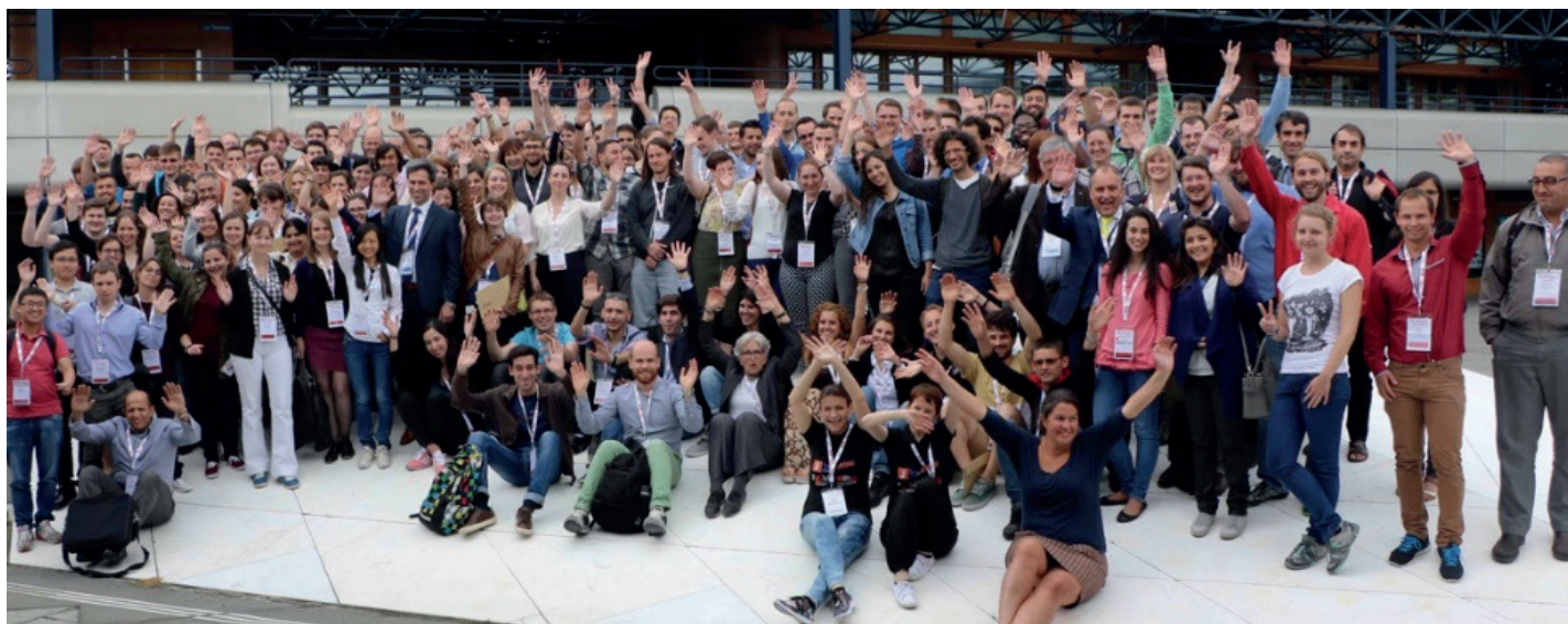
Delegates together at the last day of the conference